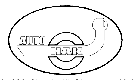
76–200 Słupsk. Ul Słoneczna 16 K

Template for towbar cat. no. Y22A designed to install in car: HONDA ACCORD 4/5 doors produced since 10.1993 till 10.1998